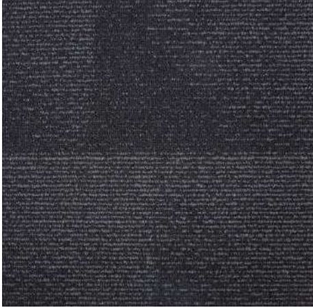
C2 - 01 Pompeii Ash