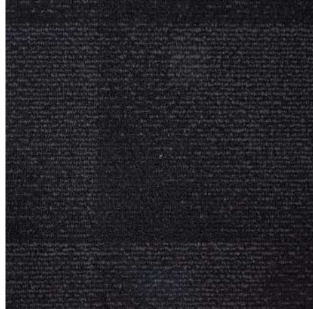
C2 - 02 Domino