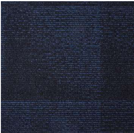
C2 - 03 Deep Ocean