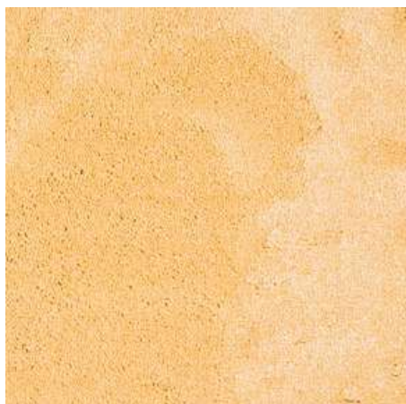
02 Light Brown