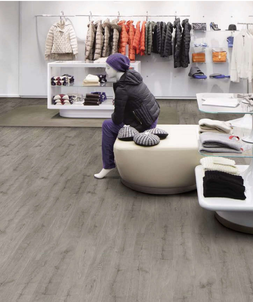
HLW/ILW 1231 Aged Pine

3.2mm (T) X 150mm X 1220mm 4.0mm (T) X 150mm X 1220mm