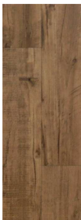
HLW/ILW 1207 Classic Hickory