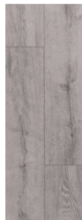
HLW/ILW 1201 Silvered Timber