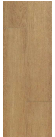
HLW/ILW 1203 Honey Classic