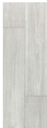
HLW/ILW 1227 Washed Oak