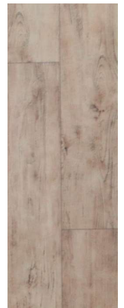
HLW/ILW 2511 Blond Oak