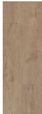
HLW/ILW 1202 Natural Timber