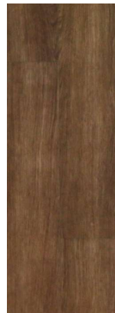
HLW/ILW 1205 American Oak