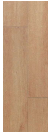
HLW/ILW 1204 Pale Cherry