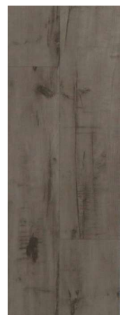
HLW/ILW 1231 Aged Pine