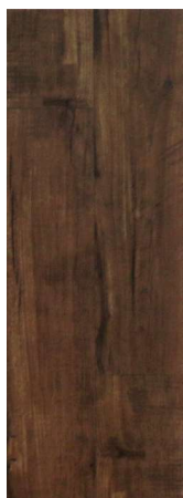
HLW/ILW 1208 Heritage Hickory