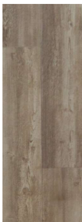
HLW/ILW 1230 Smoked Pine