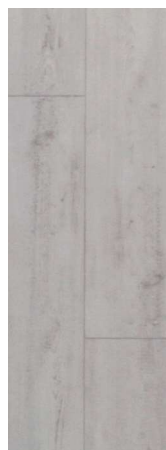
HLW/ILW 1228 Bleached Pine