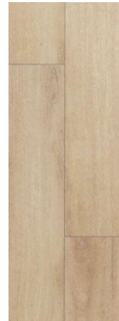
HLW/ILW 1206 Light Classic