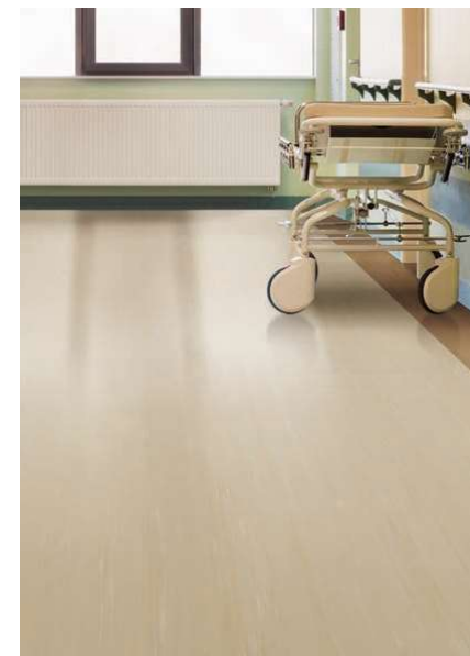
ARD 3012-01, ARD 3006-01

Color of the above product can be different from actual product color.