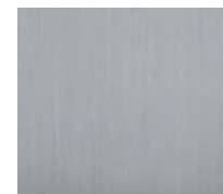
ARD 3001-01 Limestone