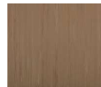
ARD 3006-01 Jasper