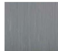
ARD 3002-01 Zirconium