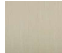
ARD 3004-01 Dolomite