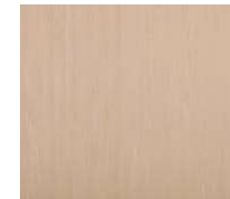
ARD 3005-01 Sandstone