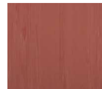
ARD 3014-01 Ruby