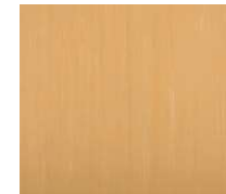
ARD 3013-01 Topaz