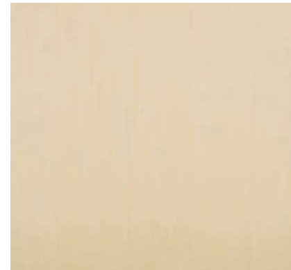
ARD 3012-01 Citrine