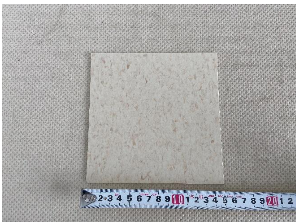
Front View(Test surface)